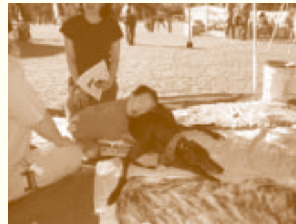
2006 Down's Syndrome Picnic

Dogs are not our whole life, but they make our lives whole. - Roger Caras