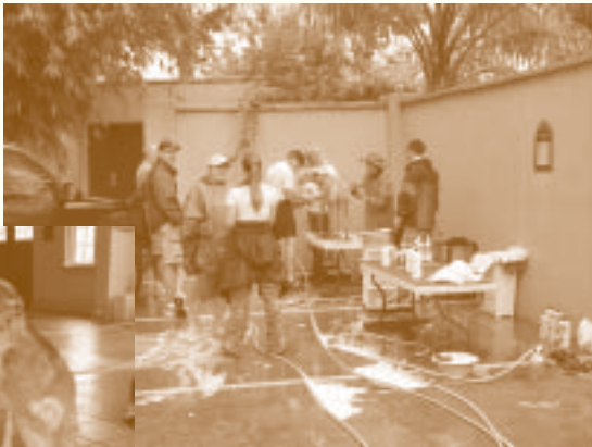
2006 Grey Spa & Merchandise Party

Anybody who doesn't know what soap tastes like has never washed a dog . . . . . Franklin P. Jones.